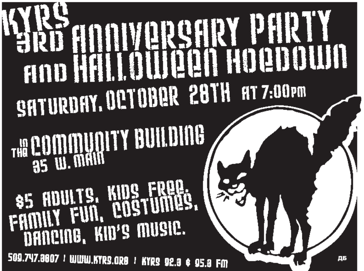
Appendix D: A sample flyer for an anniversary party.